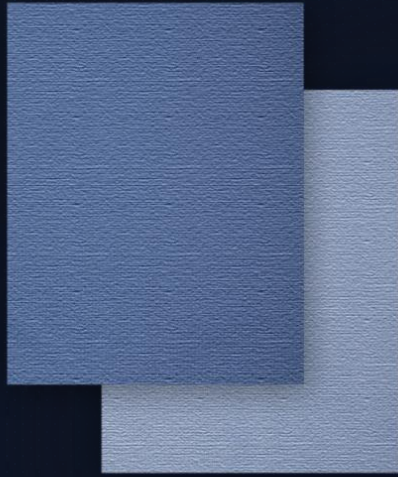
SAMPLE A Penetration without SPC