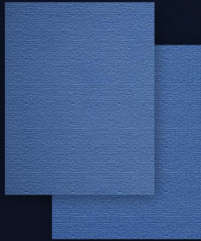
SAMPLE B Penetration with SPC