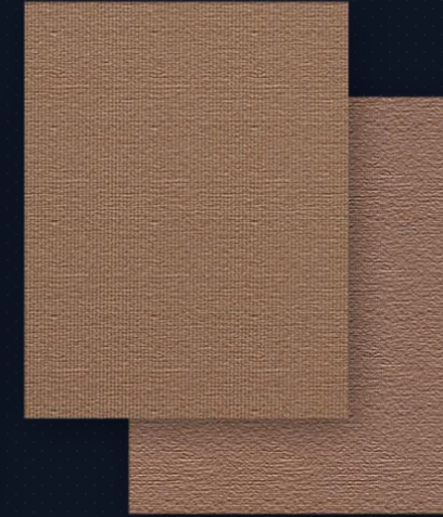
SAMPLE B Penetration with SPC