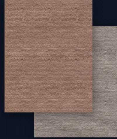
SAMPLE A Penetration without SPC