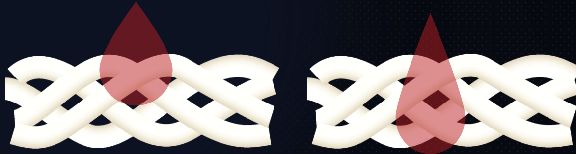
PENETRATION WITHOUT SPC

SPC is designed to enable homogeneous color penetration into fabrics in direct-to-textile printing by utilizing several complementary elements.